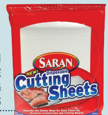
SARAN DISPOSABLE CUTTING SHEETS