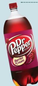
DR PEPPER BERRIES & CREAM